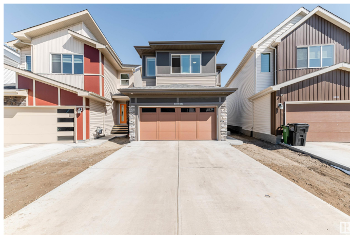
2023 157 St SW, Edmonton, AB

MLS® # E4429767 Price $599,900 Bedrooms 4