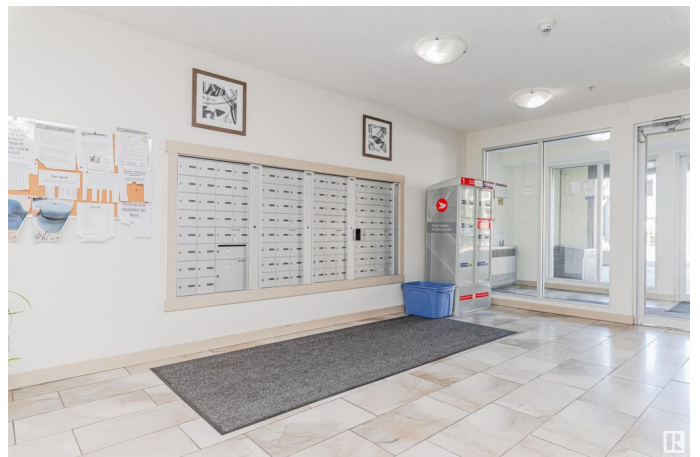
223-5816 Mullen Pl NW, Edmonton, AB