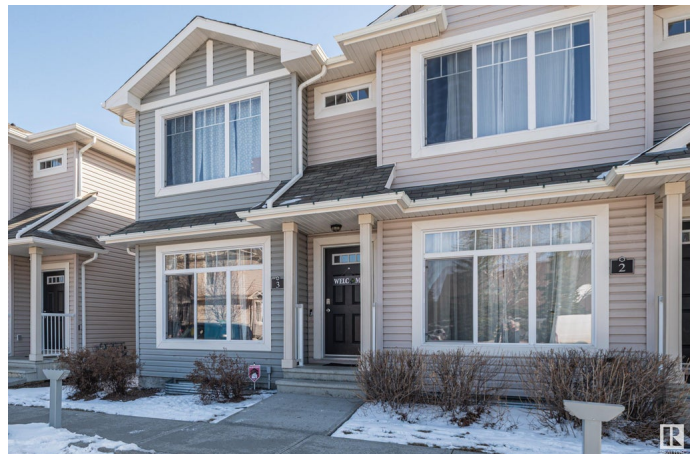
3-6032 38 Ave NW, Edmonton, AB

Main Floor Exterior Area 487.63 sq ft Interior Area 437.16 sq ft